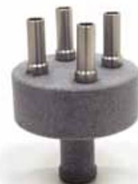
article 0395 Yirro-plus® Sprinkler adaptor '4' stainless steel, SLS