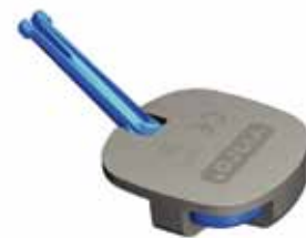
article 0514 [6-pack] Yirro-plus® noSPOT autoclave cap durable plastic