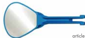
article 0002 [6-pack] Yirro-plus® mirror head no. 2 18.6 mm flat HR mirror, reusable